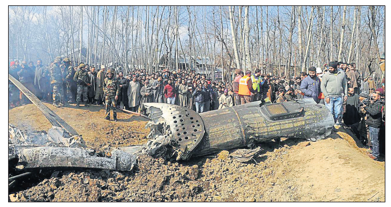
Villagers gather near the wreckage of an Indian Air Force helicopter after it crashed in Budgam area, outskirts of Srinagar, Jammu and Kashmir, on Wednesday

Catch alimpses of major events that occurred across the country last week as seen through photographs taken by HT and news agencies