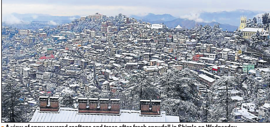
A view of snow covered rooftops and trees after fresh snowfall in Shimla on Wednesday

A man covers fenugreek seeds by soil at Versova in Mumbai on Thursday