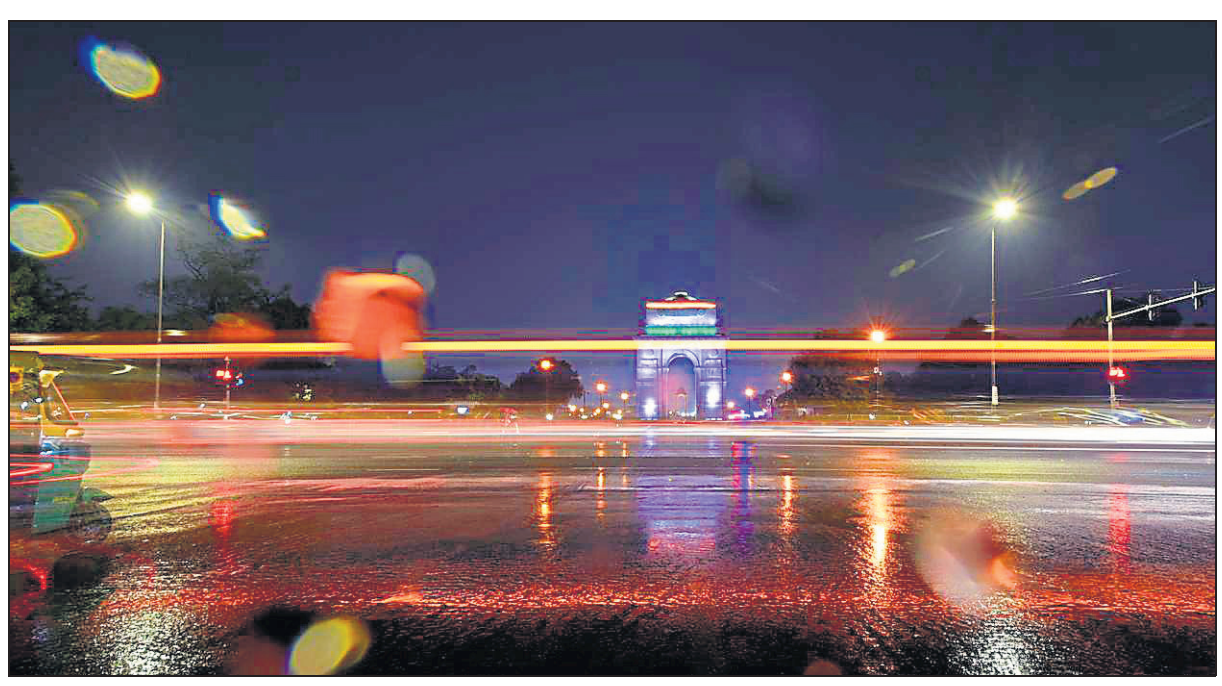
Light trails from cars are seen during the rain at India Gate on last Monday