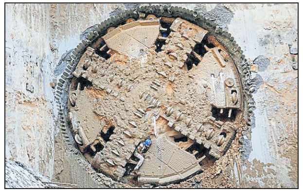
A worker comes through a Tunnel Boring Machine breakthrough point after successfully building a tunnel for the metro train in Ahmedabad on last Monday

IAF's Sarang team performs on the last day of the 12th edition of AERO India at Yelahanka Air Base in Bengaluru on Sunday